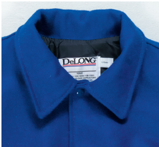
Style #4 Wool Byron Collar-Matching or Contrasting