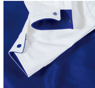
Cuff - Leather, Vinyl, Wool Snap on cuff matches jacket front snap color