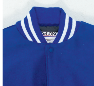
Style #7 Knit Stand-up Collar, no charge, Standard Collar