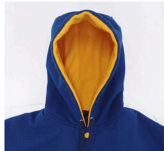
Style #H 3-Piece Hoodie 1st color is inside of hood, 2nd color is outside.