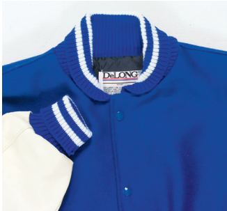
Style #G "Whiting Rolled Style" Single ply rib knit trim with rolled cuffs

White-56 hood and sailor collars are standard using Fleece fabric. Braid is optional in 1 or 2 colors