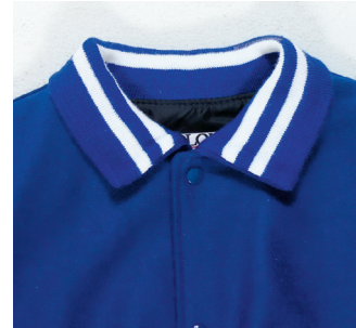
Style #8 Knit Byron Collar